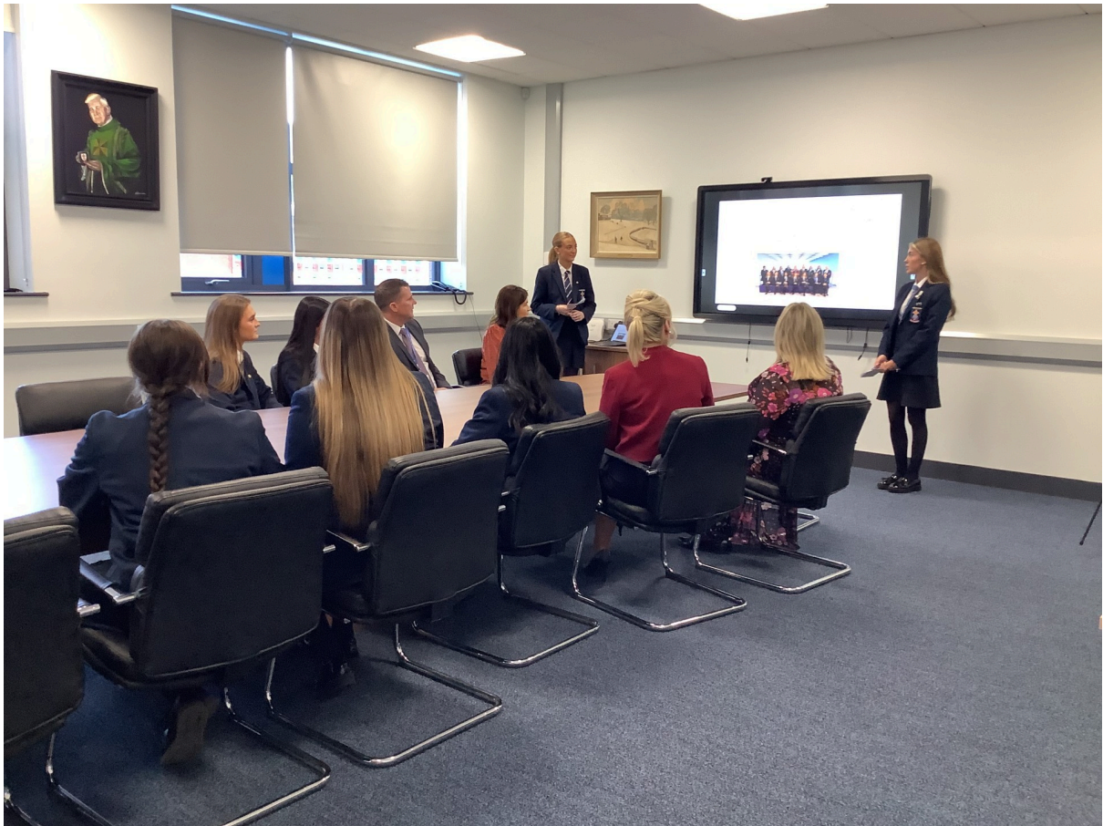
Pictured: Period Dignity Ambassadors delivering a presentation about their role to the First Minister of Northern Ireland, Michelle O'Neill, last year.